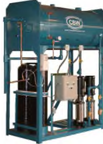
CBW Feedwater Tank

A compact feedwater system to take up less space by incorporating a water softener, feedwater pumps, control panel and hardness alarm into one system, ready to pipe into any system.